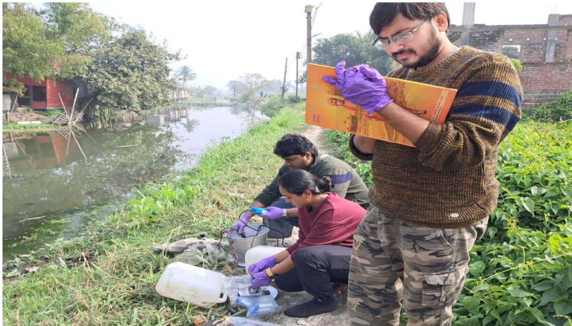
Bio-remediation experiments of Waste Water Canals in the Kolkata Metropolitan City by the PhD students